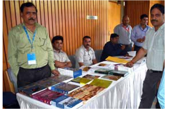
Make-shift bookstall installed by Publications Unit of ICHR at the Seminar