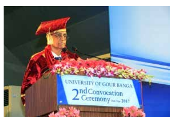
Chairman addressing the audience at the Convocation Ceremony of University of Gour Banga

address. the Delivering convocation Chairman said that the occasion draws one's attention to the present education system. He continued, "Our elders say that education makes a man civil and human. Characterbuilding is considered the main object of the system. Our system goes a step further. spiritual accomplishments. aims at Therefore, we nurtured both apara (worldly) and para(non-worldly) systems in our education. India has a rich knowledge tradition. The English records vouchsafe the existence of pathasalas (schools) in the