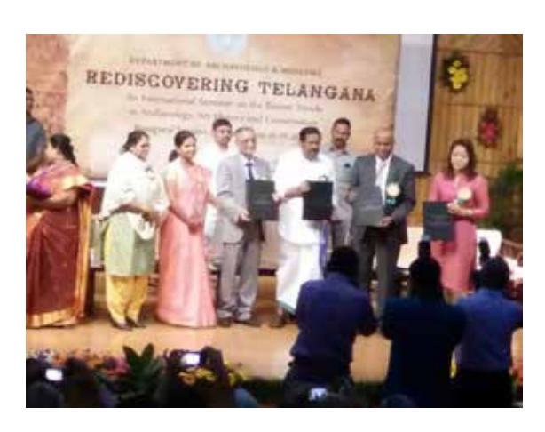
Chairman seen with other scholars at the seminar in Hyderabad

Tanjavur/Kanchipuram in to Chennai, the south and reaching up to west coast. Flourishing in trade and commerce with Africa, Europe, Burma, China and southeast Asia, the region facilitated the rise of great empires ruling north and south India. He complimented that the Department of Archaeology serving from Hyderabad has an illustrious history in developing the historical tradition under very able scholars and historians. He said that ICHR has also been providing guidance and financial assistance to various research projects on the history of the region.